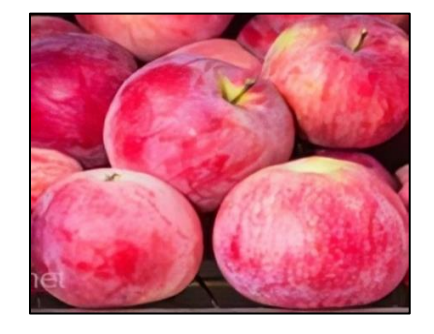
Figure 3. Chalking Problem on Apple [29]

Besides, the storage conditions like temperature and relative humidity of the fruits after being coated with lipid-containing materials are vital to avoid the problem of chalking, also known as wax-shifting. This is due to the fluctuation of the temperature and humidity during storage and generally observed in the shellac-coated fruits that transferred from chiller to the condition of higher humidity and temperature. The lipid partially solubilizes in the moisture on the surface of fruits which is formed as a result of condensation process [4]. As shown in Figure 3, when chalking problem occurs, there are white and translucent particles depositing on the surface which affecting the appearance of the fruits. The chalking problem worsens when there is heavy and thick waxing being applied.